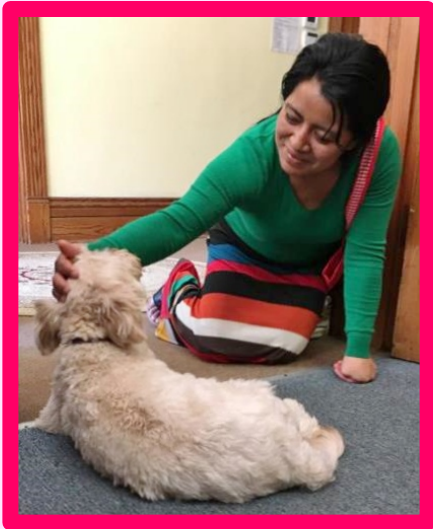
Me and a member of my new family. Every week she comes to the sewing class and always leaves me in stitches!

I've learned so much this past year in my new home. The big thing: second chances give us all another opportunity for a new life full of friendships, surrogate families, and love. Practically everyone here has been "adopted." There are folks displaced from warring factions, immigrants fleeing for their lives and from persecution, former criminals and addicts, and poverty-stricken and jobless U.S. born persons who are now part of the St. Leo family. There are also folks who have adopted us , sharing their time, talent, and kindness. We consider everyone family. Because, let's face it, we're all part of this one big world. You and me, me and you, you and you and you.